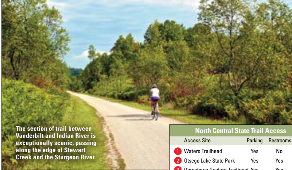
The section of trail between Vanderbilt and Indian River is exceptionally scenic, passing along the edge of Stewart Creek and the Sturgeon River.